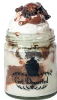
Vanilla Brownie Crumble @200