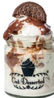
Vanilla Oreo @220