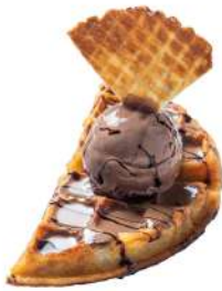
DEATH BY CHOCOLATE