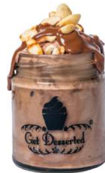
Nutty Nutella @250