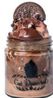
Choco Oreo @220