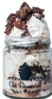
Vanilla Brownie Oreo @250