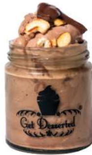
Swiss Choco Fudge @200