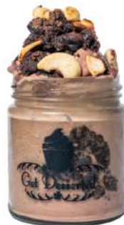
Brownie Cashewnut @250