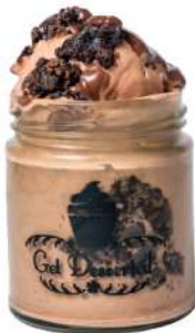
Choco Brownie Crumble @200