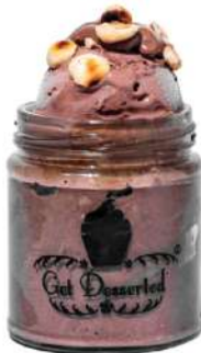
Choco Hazelnut Fudge @220