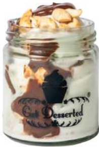
Vanilla Choco Fudge @200