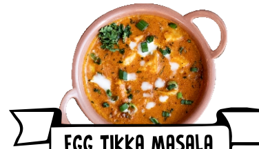
EGG TIKKA MASALA

Boiled eggs in cheesy red gravy along with herbs and spices