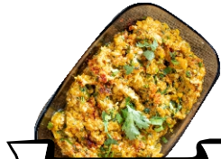
PERI PERI EGGS

Hard boiled eggs filled with chefs special cheesy paste with a tinge of spice and grated cheese