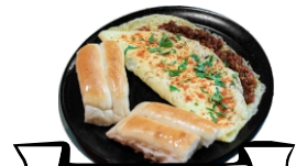
Egg Mysore masala dosa

Regional fav dish made with a mix of grated boiled eggs and sunny side up with Indian spices