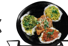
FOUR IN ONE

Boiled eggs in cheesy red gravy along with herbs and spices