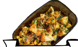
SMOKY BARBEQUE EGGS

Scrambled eggs with the punch of peri peri marinade served with bread and salad