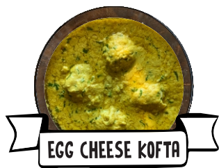
EGG CHEESE KOFTA